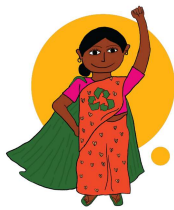
Urban Waste pickers