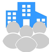
Local Citizens and Municipality