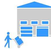
Informal waste Management MSMEs